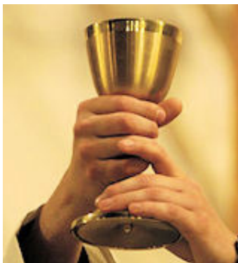
Blood of Christ falling upon the earth in the Agony. Have mercy on us.

The month of July is dedicated to the Precious Blood of Jesus. The feast of the Precious Blood of our Lord was instituted in 1849 by Pius IX, but the devotion is as old as Christianity. The early Fathers say that the Church was born from the pierced side of Christ, and that the sacraments were brought forth through His Blood.