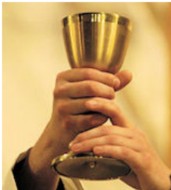
Blood of Christ falling upon the earth in the Agony. Have mercy on us.

The month of July is dedicated to the Precious Blood of Jesus. The feast of the Precious Blood of our Lord was instituted in 1849 by Pius IX, but the devotion is as old as Christianity. The early Fathers say that the Church was born from the pierced side of Christ, and that the sacraments were brought forth through His Blood.